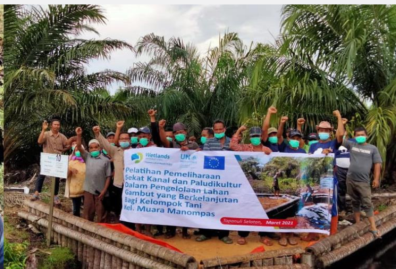
Fig 4: Community group members planting Jelutong, the peat native species in rewetted peat area